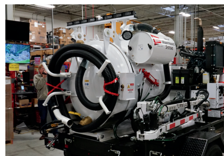
The heavy-duty spoils tank features a two-cylinder electric over hydraulic slide, tilt and dump functionality for easy emptying