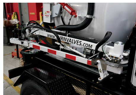
With the ERV-750 extended reach valve exerciser an operator can turn multiple nearby valves without moving the vehicle