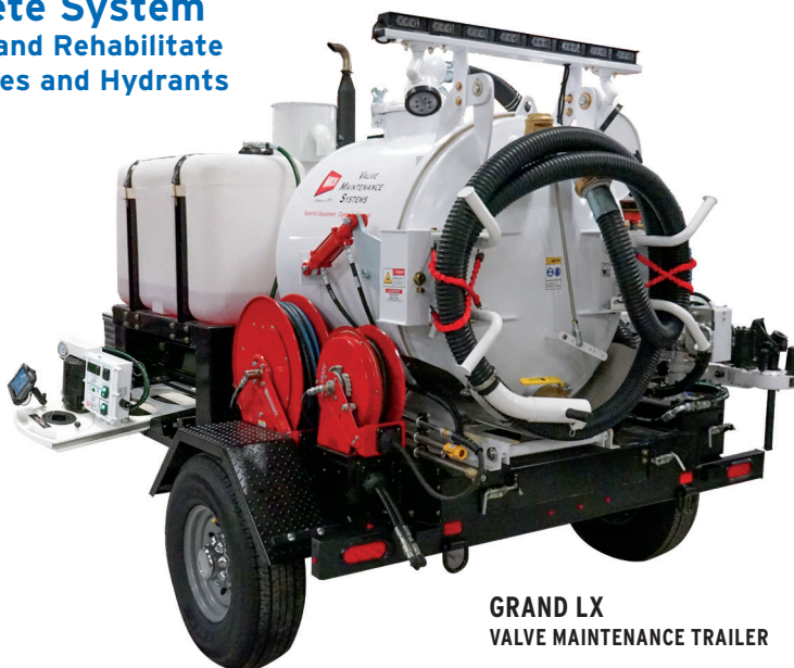
GRAND LX VALVE MAINTENANCE TRAILER

The Wachs Grand LX Valve Maintenance System has all the tools for water distribution preventative maintenance. Built for safe operation, a two-person crew can find valves, wash out valve boxes, and safely exercise and rehabilitate valves up to 13 feet away with the ERV-750 valve exerciser. The included handheld computer with VITALS Software records the valve info and status for transfer back to headquarters.